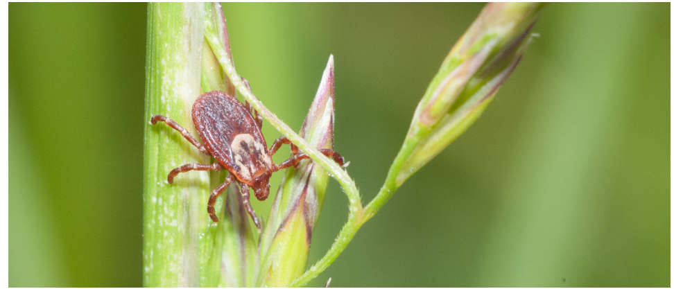
American dog tick.

Rutgers University scientists designed an urban mosquito control program, in which scientific advisors guide residents. This approach builds trust and gives the community ownership. A Maryland town that tested the approach had 80% of residents deploy traps and a 76% reduction in mosquito biting.