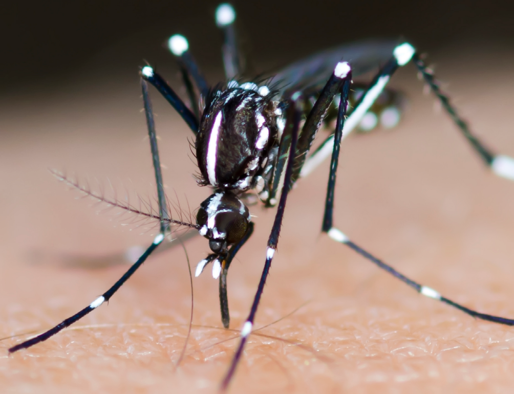
Asian tiger mosquito.

This project, NE1443: Biology, Ecology & Management of Emerging Disease Vectors (2014-2019) , was funded in part by the Multistate Research Fund through USDA-NIFA and by grants to project members at participating institutions: Auburn University, The Connecticut Agricultural Experiment Station, Cornell University, University of Idaho, Illinois Cooperative Extension, Indiana University of Pennsylvania, Iowa State University, Kansas State University, University of Kentucky, University of Maryland, University of Massachusetts, University of Minnesota, Mississippi State University, University of Nebraska, North Carolina State University, Ohio State University, Oregon State University, Pennsylvania State University, University of Rhode Island, Rutgers University, Texas AgriLife Research, Virginia Polytechnic Institute and State University, University of Wisconsin, and the USDA-ARS. Learn more: bit.ly/NE-1443